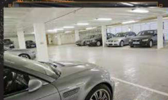
Adequate Car Parking facility