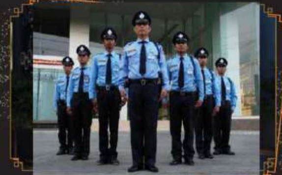
Round the clock Security Service