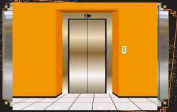
Modern Passenger elevator