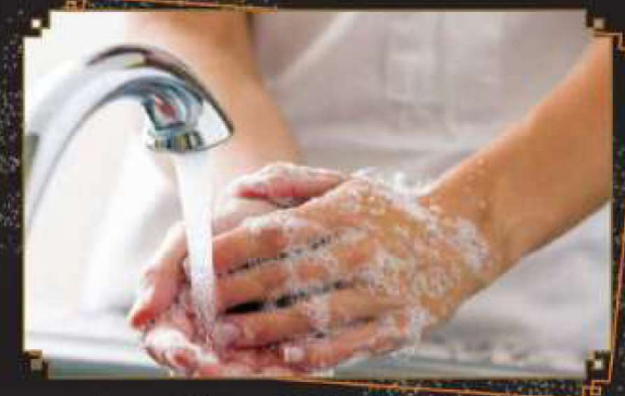
Classy Fittings & fixtures