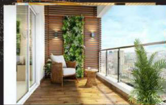
Spacious sit-out balconies