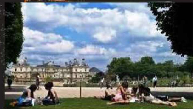
Separate Female Adda Zone