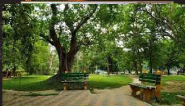
Separate Zone For Senior Citizens