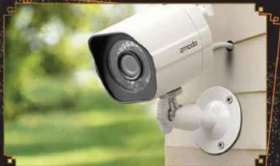
Advanced CCTV surveillance