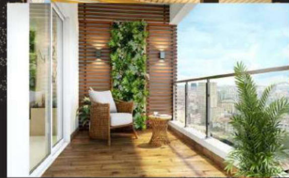
Spacious sit-out balconies