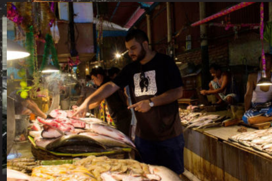
Park Circus Market in 2 mins