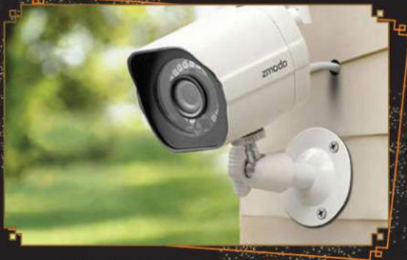
Advanced CCTV surveillance