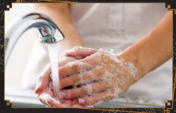
Classy Fittings & fixtures