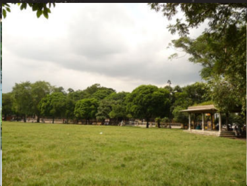
Renowned Park Circus Maidan in 2 mins