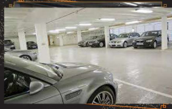
Adequate Car Parking facility