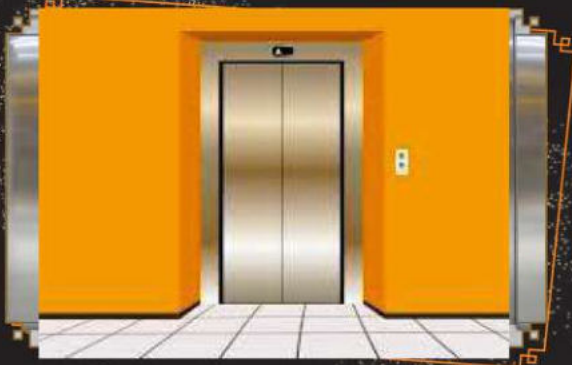
Modern Passenger elevator