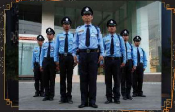
Round the clock Security Service