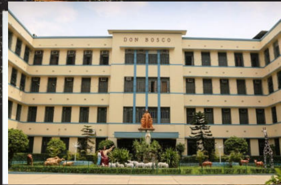
Renowned school within 2 mins