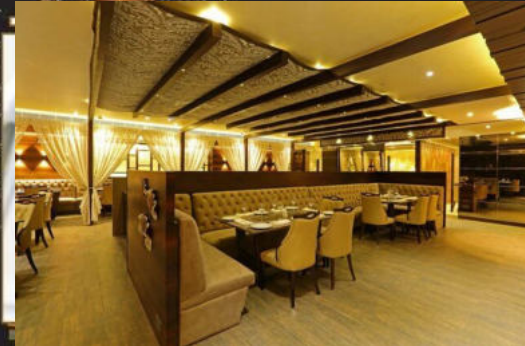
Restaurants within 2 mins