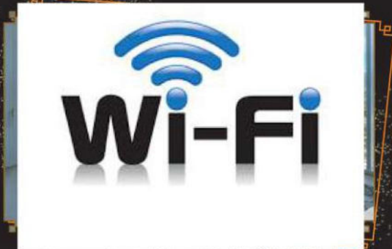
Wi-fi for 24 Hours