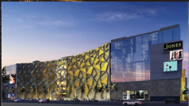
Quest Mall within 2 mins