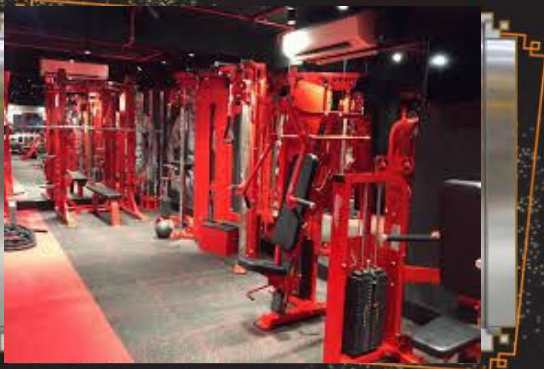
Gym within 2 mins