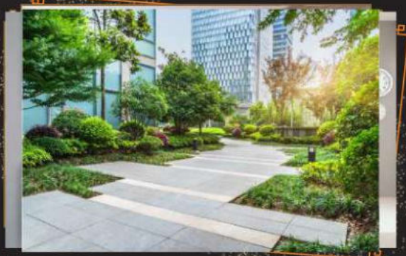
About 30% Greenery around the premises