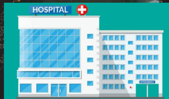
Multispecialty Hospital in 1 min