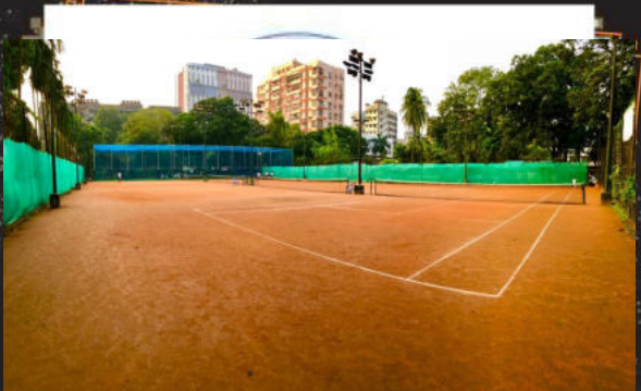
Tennis court within 2 mins